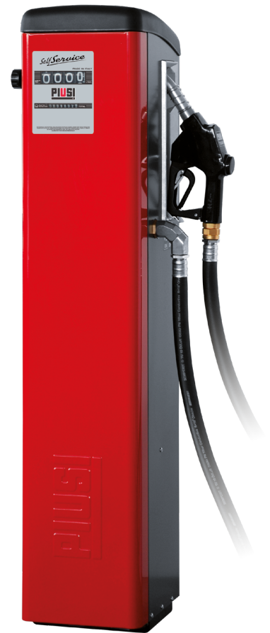
SELF SERVICE K44