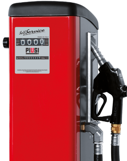
MECHANICAL METER INTEGRATED