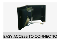
EASY ACCESS TO CONNECTION