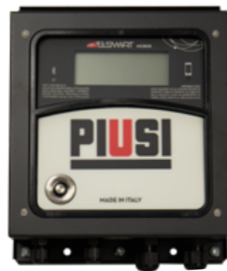
MCBOX B.SMART COMPACT