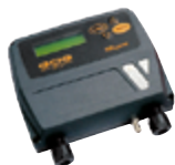
TANK LEVEL INDICATOR