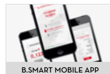
B.SMART MOBILE APP