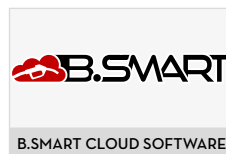
B.SMART CLOUD SOFTWARE