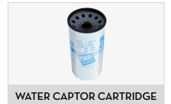
WATER CAPTOR CARTRIDGE