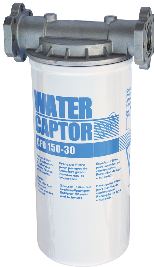
WATER CAPTOR 150 L/MIN