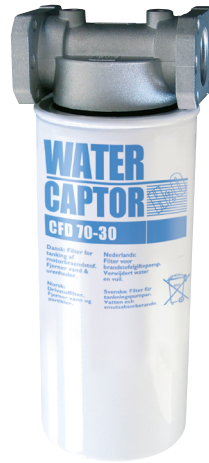
70 L/MIN WATER CAPTOR WITH WATER ABSORPTION